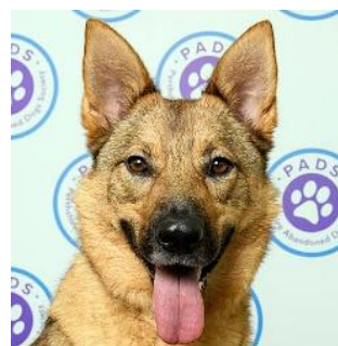
HAYLEY – A FRIENDLY GIRL