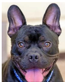
PINGU – A STAFFIE CROSS