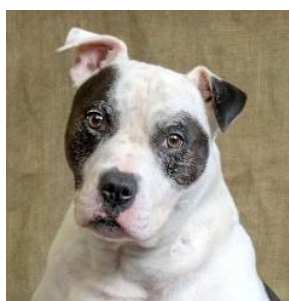
KOBE – A NICE BULLDOG CROSS

RIVERSIDE PRIMARY SCHOOL'S YOUNG ARTISTS SENT PADS THESE DRAWINGS OF SOME DOGS IN OUR CARE. THEY HAD BEEN MADE INTO CARDS BY THE GROUP OF 10 YEAR OLDS AS GOOD WISHES TO THE DOGS. WE THINK THEY CAPTURE VERY WELL THE PERSONALITY OF EACH ONE AND SEND IN RETURN OUR THANKS TO THESE TALENTED YOUNGSTERS AT THE PERTH SCHOOL. IT'S NOT OFTEN OUR DOGS ARE THE SUBJECT OF SUCH CLEVER ARTWORK SO WE THOUGHT WE WOULD PASS ON THIS LITTLE GALLERY TO OUR READERS!