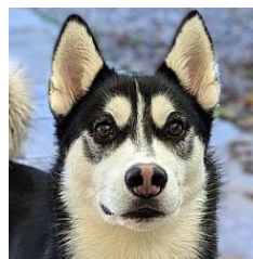
NANUK – A BOLD HUSKY