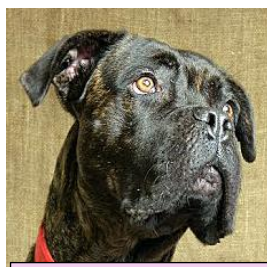
ALPI – A SAD CANE CORSO