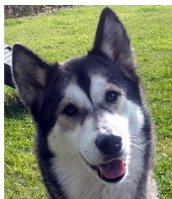
SIENNA – A GENTLE HUSKY